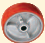
Paythane polyurethane bonded to a metal center