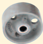
Payductile Steel cast high tensile ductile iron