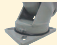
SS Swivel Seal Neoprene seals protect swivel raceways