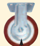
Metal Shields for tapered bearings