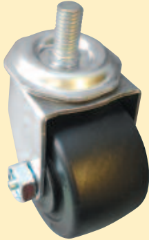
OCTAGON WASHER FOR TURNING STEM