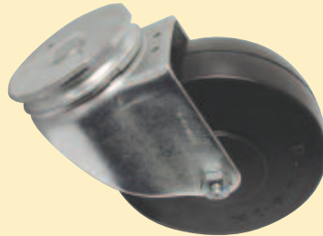
CIRCULAR TOP PLATE CASTER