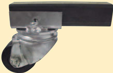
SQUARE TUBING MOUNTING CASTER