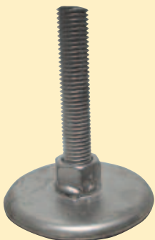
RUBBER PAD GLIDE