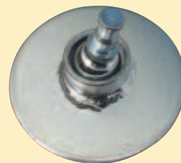
SWIVEL METAL PAD GLIDE