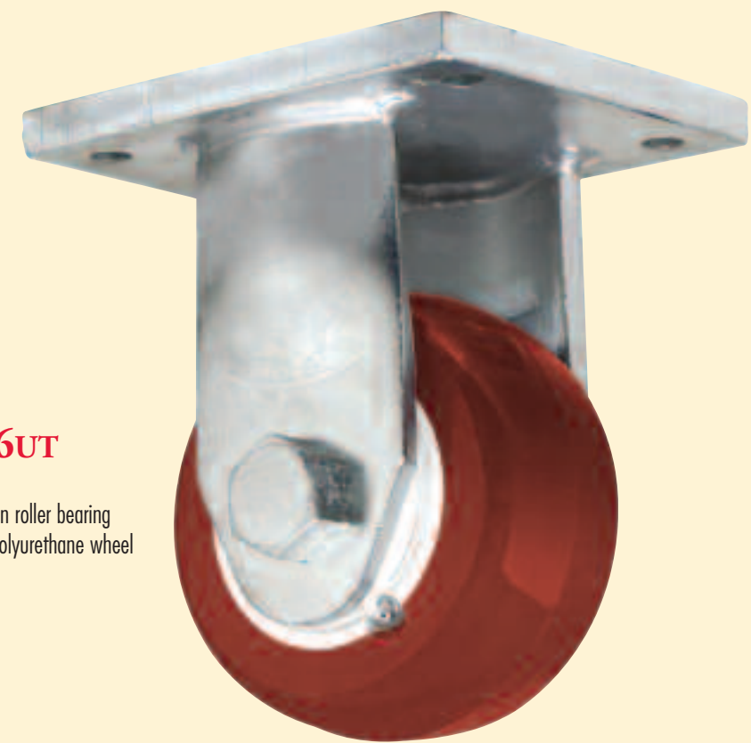
701-6UT • 6" rigid • Anti-friction roller bearing • Miratek polyurethane wheel