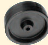
Peejay polyolefin plastic