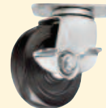
WK Brake locks wheel, not used with Thread Guards, swivel only