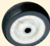
Mirakush 85 duro. gray polyurethane