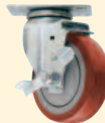
WK Brake locks wheel, not used with Thread Guards, swivel only