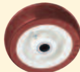
Miratek 95 duro. red polyurethane