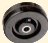
Plexite Phenolic macerated canvas