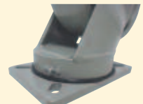
SS Swivel Seal Neoprene seals protect swivel raceway