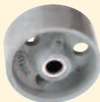
Payductile Steel cast high tensile ductile iron