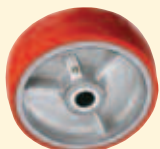
Paythane polyurethane bonded to a metal center