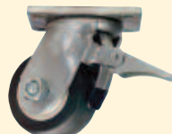
WB Brake shoe locks wheel